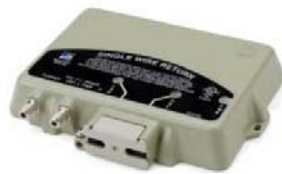
Single Wire Return Device – Typically installed outside of your home.