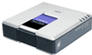
Broadband Telephone Adaptor